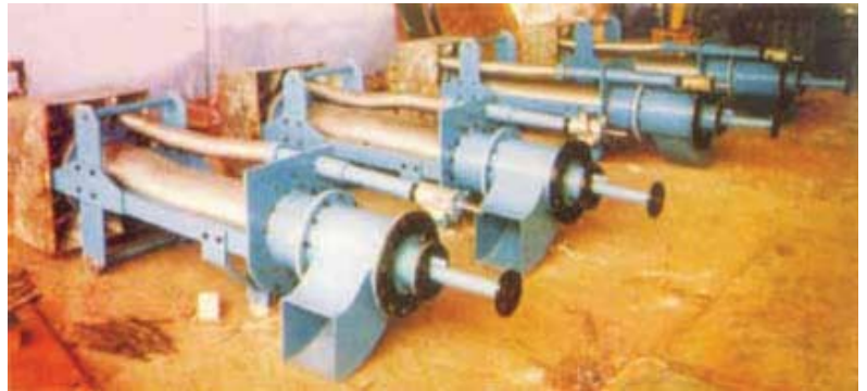
WINDBOX for 210 MW Boiler

We engineer, design and manufacture all types and sizes of coal nozzles, nozzle tips to withstand virtually any operating environment.